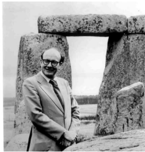
Professor Lord Colin Renfrew – 1937 – 2024