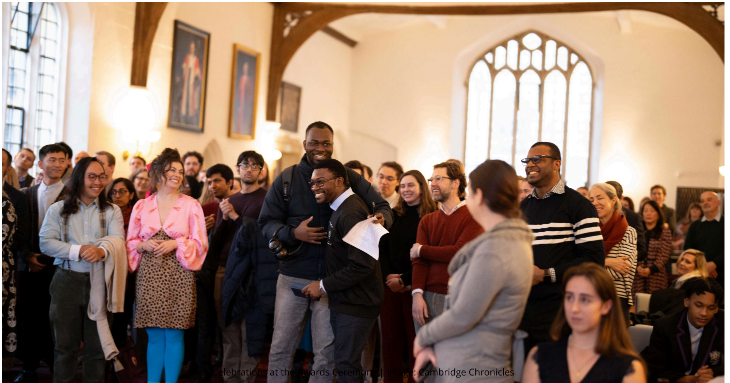
Celebrations at the Awards Ceremony